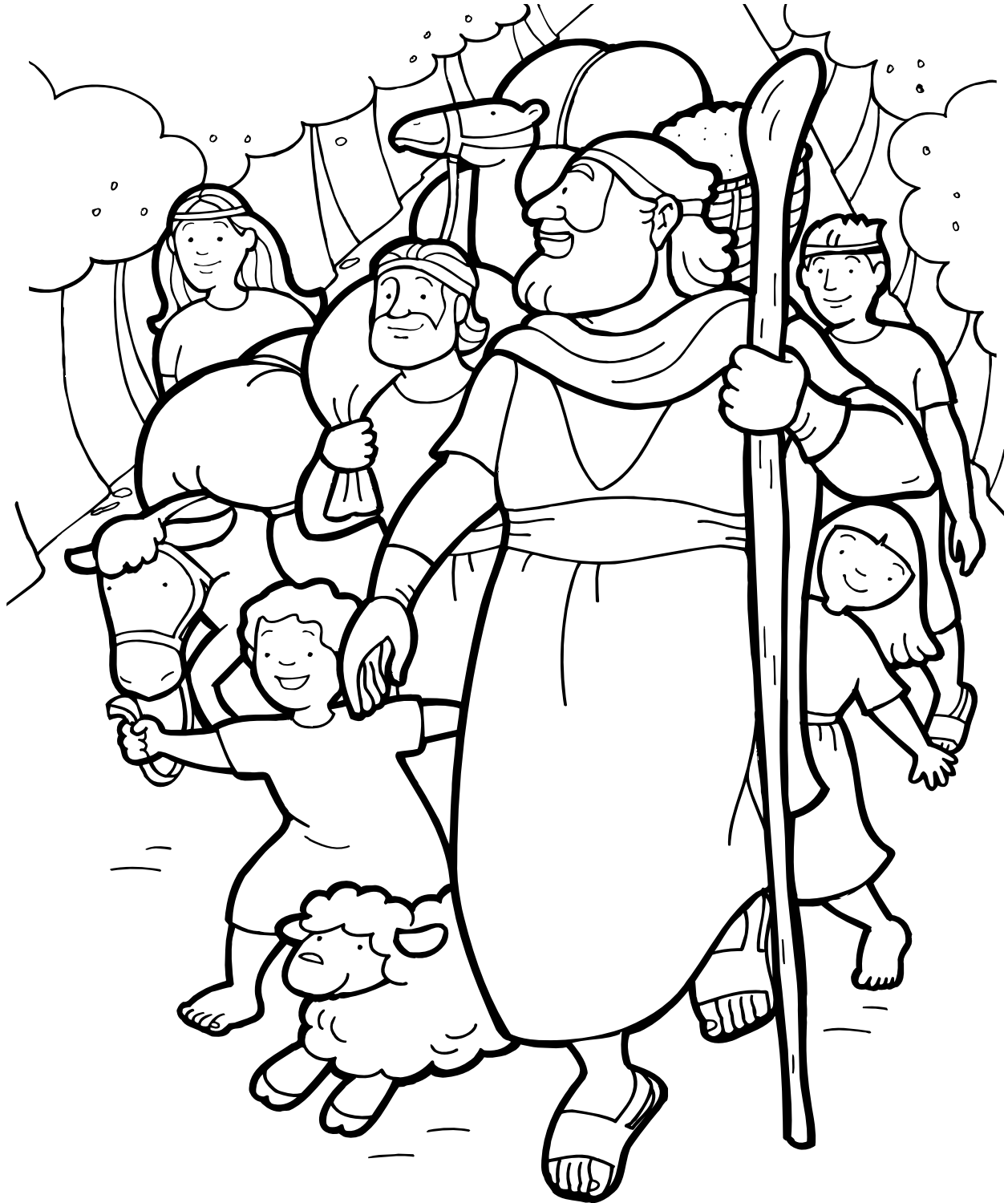
God makes a path through the Red Sea. Exodus 14:1-31